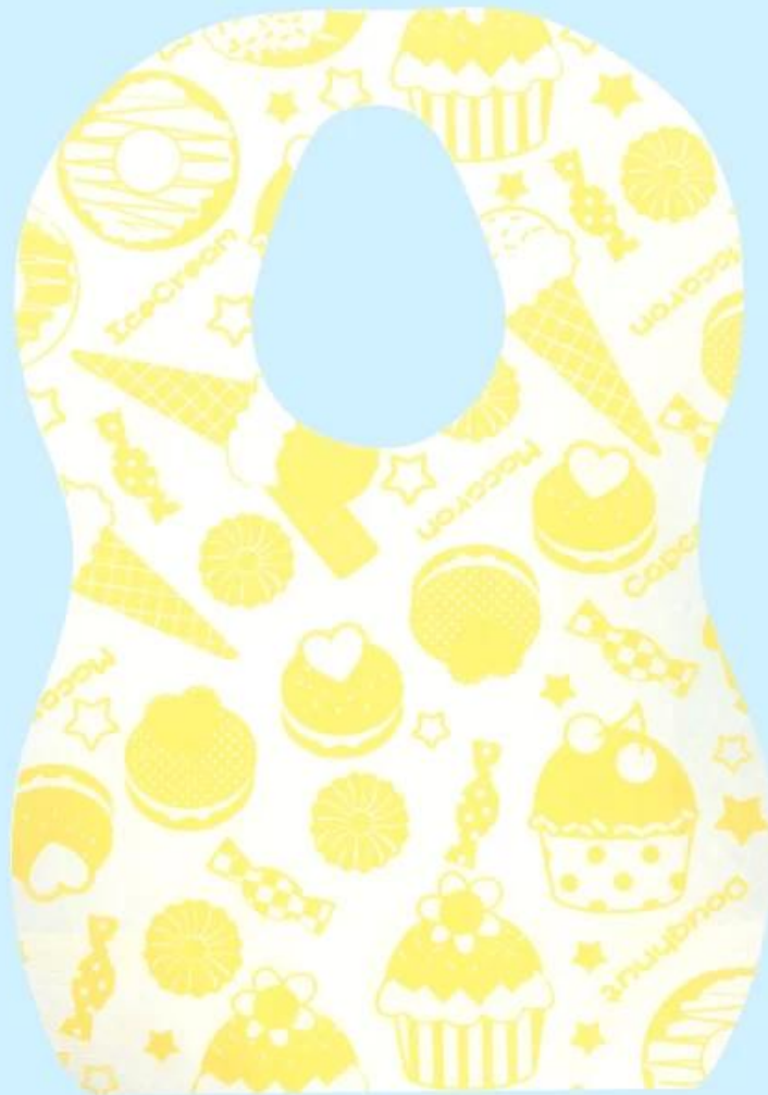
U-Shape Optional ,and different Pattern supportable